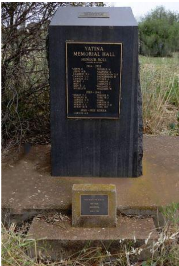
Yatina Memorial Hall Honour Roll