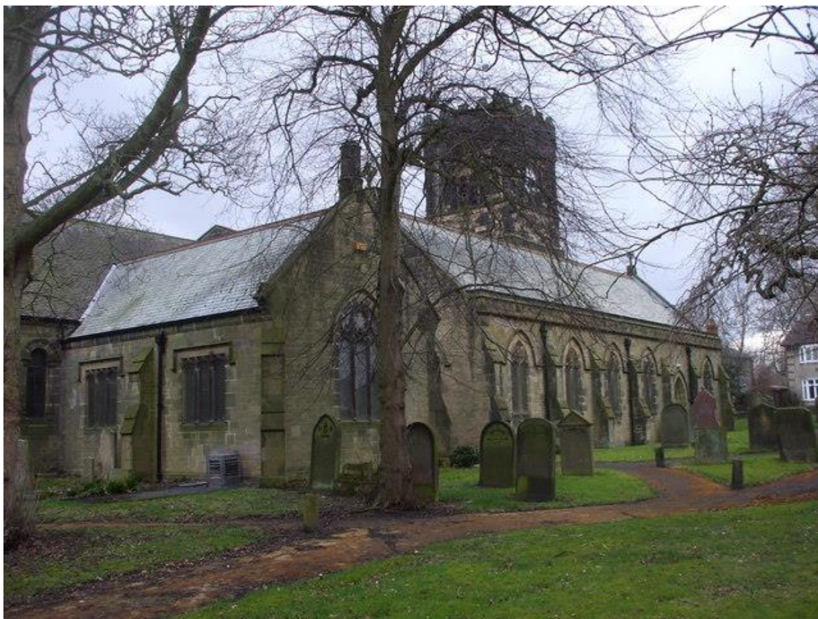
St. Cuthbert Church, Bedlington

St. Cuthbert Churchyard, Bedlington has only two Commonwealth War Graves – both from World War 1.